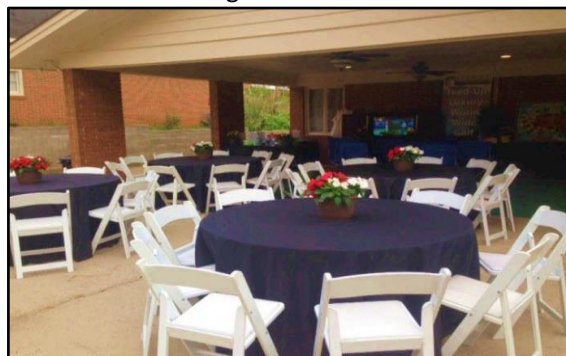
Teed Up Hospitality Suite